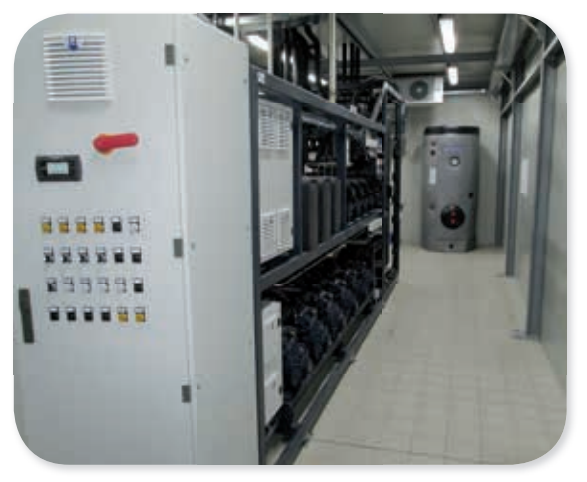
Enex compressor rack