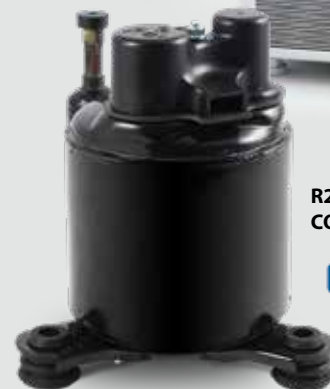
R290 ROTARY DC INVERTER COMPRESSOR