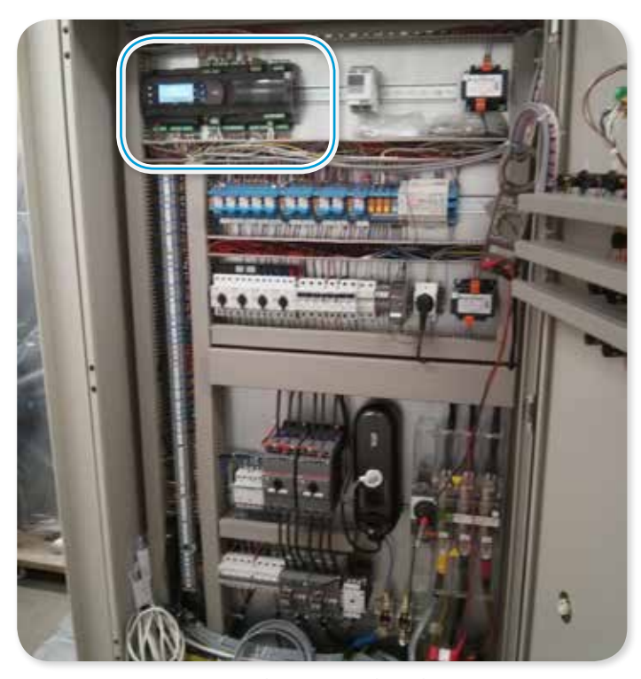
pRack pR300T on-board