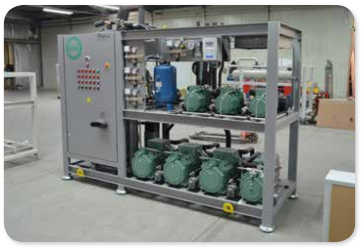
CO, Refra pack AS-TR17143F0G